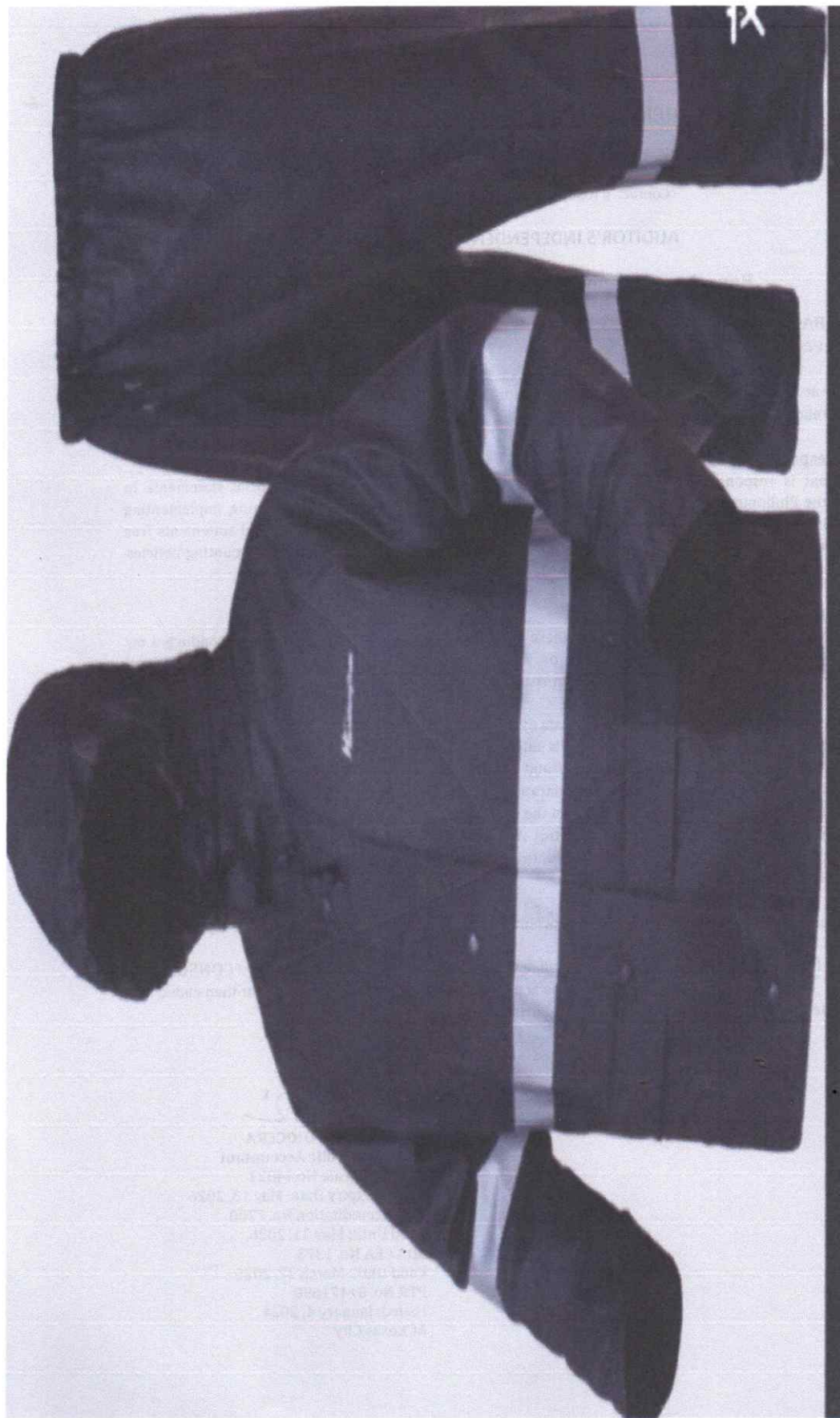
COLOR: Black or Navy Blue